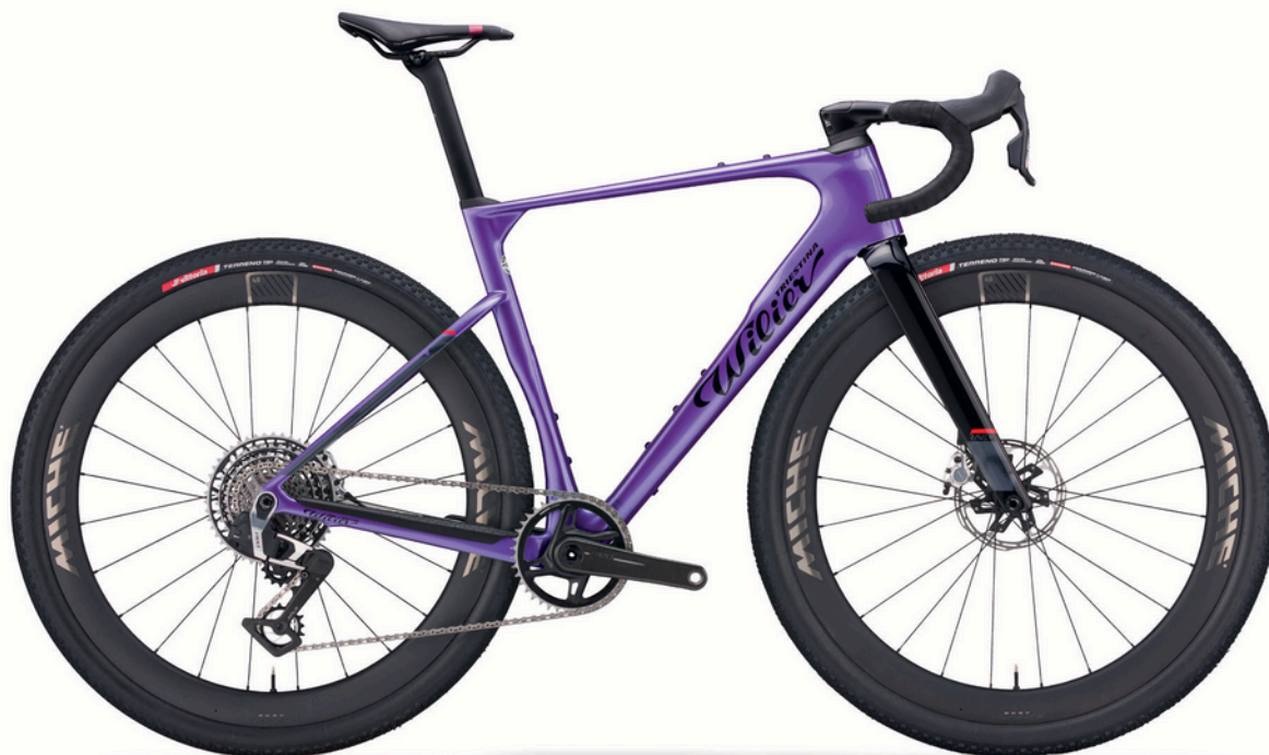
NEON PURPLE; GLOSSY-Color Code V12