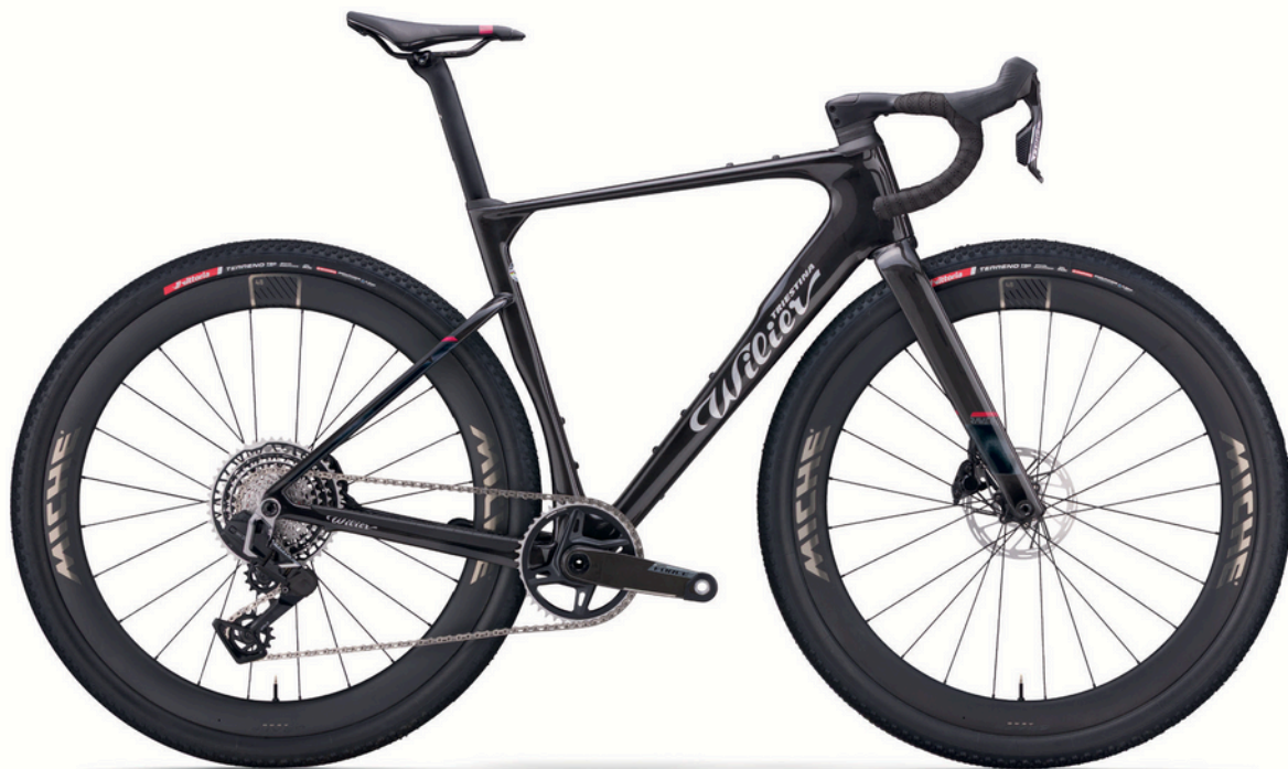
GLITCH BLACK; GLOSSY- Color Code V11

A sophisticated jet black, with exposed carbon fibres and chrome graphic details evocative of digital glitches. This colour, reflecting feistiness, elegance and technology, is ideal for lovers of minimalist aesthetics yet with a rebellious soul. Glitch Black is the perfect choice for those seeking a pure, timeless racing look.