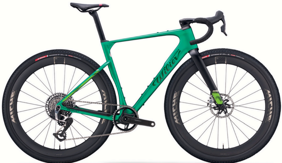
PIXEL GREEN; MATT-Color Code V10