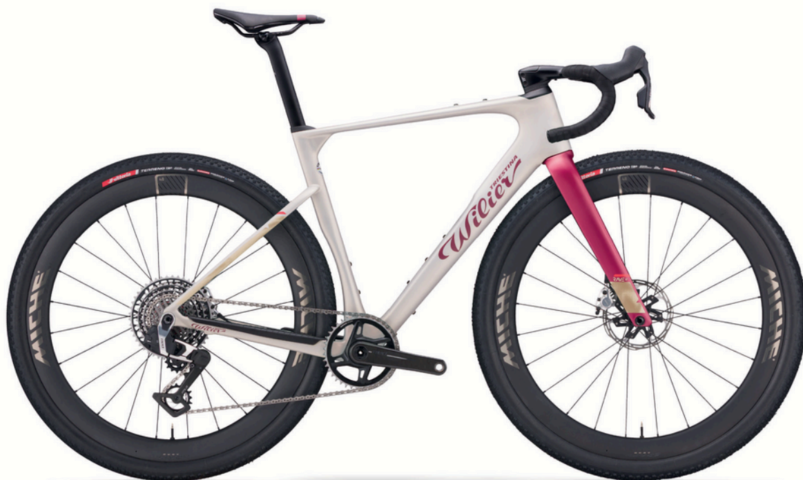
BYTE CREAM; MATT- Color Code V13

A modern retro style, with cream and deep red accents inspired by the early computers and consoles of the 1980s and '90s. Refined yet impactful, this is a tribute to the timeless vintage aesthetic that characterised an era.